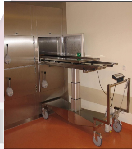
MA-1120 Loading with Universal Transporter