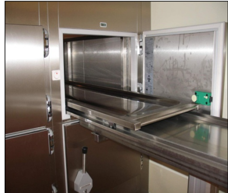
MA-1120 Insert of a body tray