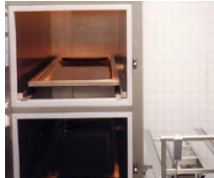
MA-1100 Body fridge for 2 corpses

Radius of 20mm for best possible hygiene / cleaning