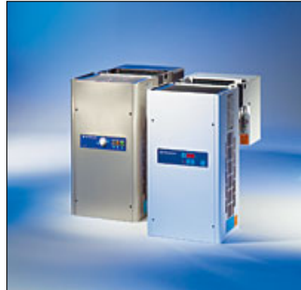
Cooling units (made in Germany) with evaporator for installation into ceiling of cold room. Refrigerant: R 404 A

Note: please see the Viessmann catalogue for further information on the cold rooms (pdf download) on our website.