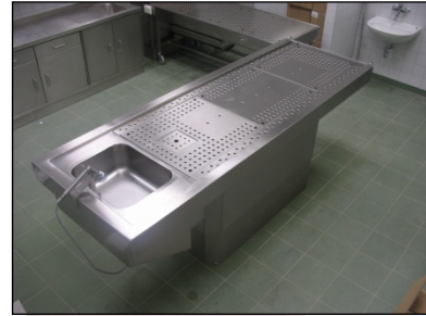
MA-0977 Autopsy Table with side wall downdraft extraction and height adjustment

Electronic height adjustment from 780 – 1080mm.