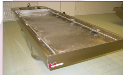
Option: rinse system below work area