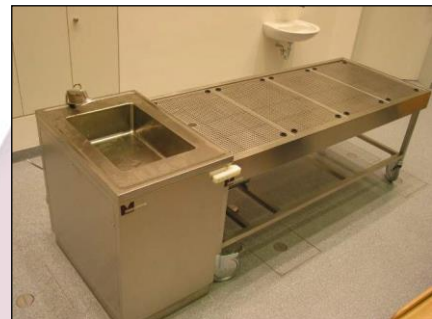
Perforated working table with downdraft ventilation. Docked to docking column

This safety wall exhaust air system is exclusively designed by MEDIS.