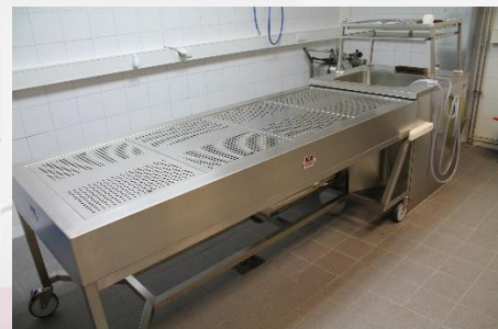
MA-0974 Docking perfusion table (mobile) with "PerfuTec" injection system incl. variable pump pressure adjustment