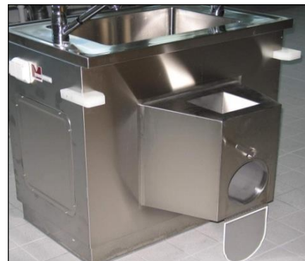
Single docking column for 1 embalming table