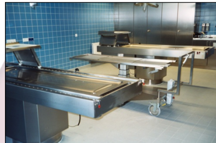
MA-2002 Autopsy Table with roll on / roll off work area (body tray) inserted

The pedestal also contains an integrated Standard Floor Extraction System (SFES) which picks up all fumes which are heavier than air directly from the floor into the in-house extraction system. The large investment in a floor extraction system build into the lower walls of the room is therefore no longer necessary.