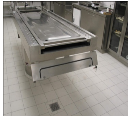
Transfer lid opened after insertion of roll on / roll off work area (body tray)

Manufactured by MEDIS MT in Germany acc. to EN and DIN norms and valid regulations of Health & Safety Authorities.