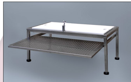
MA-0985 Organ table with grossing board, instrument tray and holder for shower