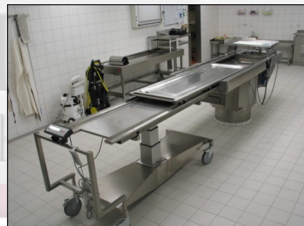
Body transfer procedure assisted by MA-2010 universal transporter