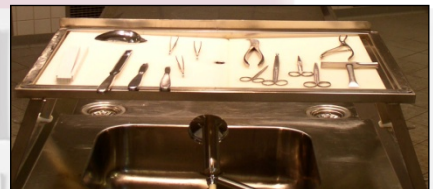
MA-0985 Organ Table