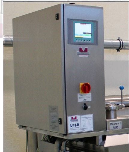
Touchscreen panel for programming. Texts in German