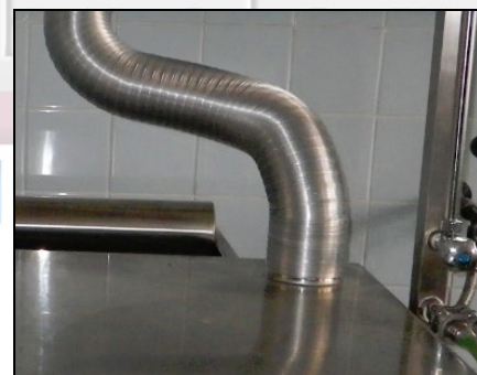
Connection to inhouse ventilators