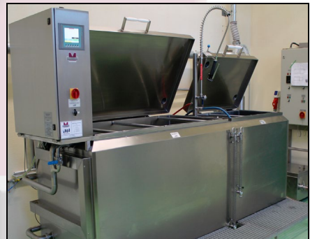
MA-1366 with opened lids and tread podium