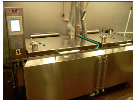
MA-1366 with two process chambers

Safety handles at the lid, which do not absorb heat.