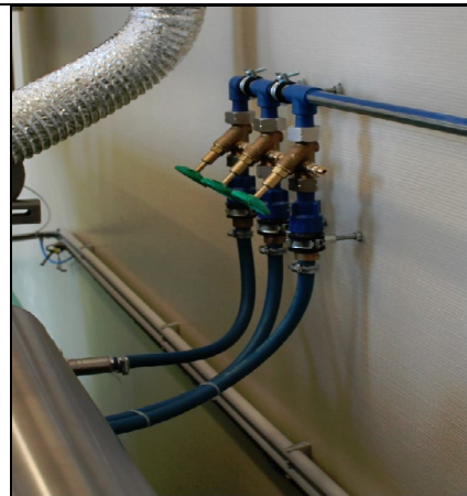
Example of the inlet at a maceration unit with 2 chambers (middle tap for supplying the shower)

Made in Germany by MEDIS MT GmbH in accordance with ISO 9001 and the valid EN standards and occupational safety and security regulations.