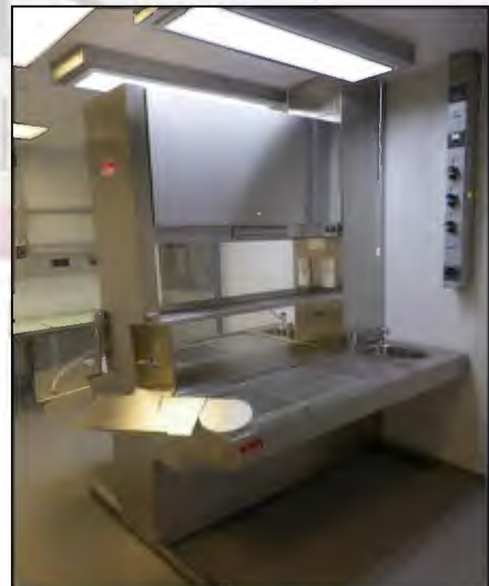
MA-2070 with superstructure and storage board. Incl. adjustable storage plate for keyboard and holder for flat touchscreen