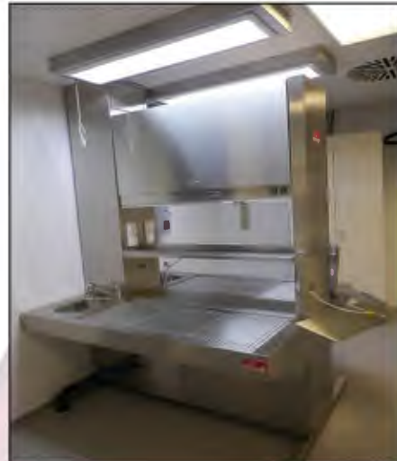
MA-2070 with superstructure. Incl. lighting and receptacles