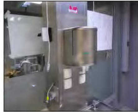
Paper towel dispenser

Manufactured by MEDIS MT GmbH in Germany acc. to EN and German norms and the health & safety regulations of the EC and Germany!