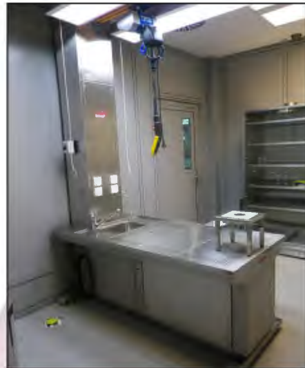
MA-2069 Animal Autopsy Table with extraction and crane track for optimal cadaver positioning

1 x crane track for optimal positioning the cadaver before dissection