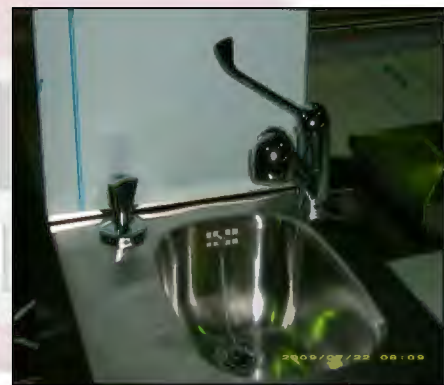
Sink with 25mm radius. Left : valve for operation of sprinkler system below work area