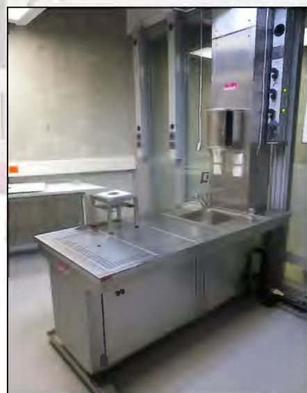
MA-2069 Animal Autopsy Table